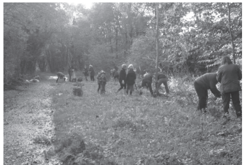
Community day on the railway line