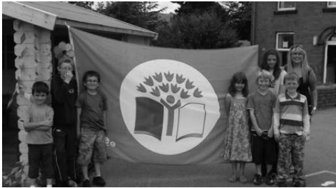
Opening of the Dream den and celebrating our achievement on being awarded the green flag