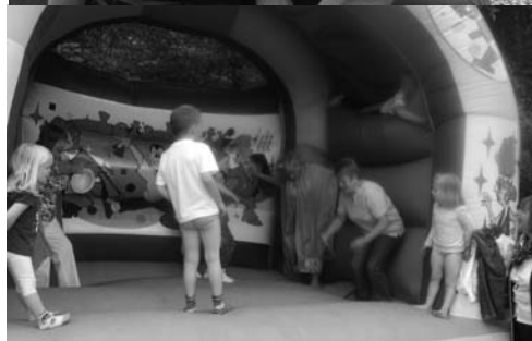
Top Left - All the residents and family members of Wenfryn Close enjoying the street party.