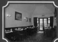
The Telford Inn Restaurant

We stock all your Electrical Requirements TV's, Cookers, Fridges, Dishwashers etc.