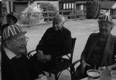
Top Right - Families enjoy an afternoon 'Party in the Park' in Garth to celebrate the Royal Wedding. Top Left - Kings and Queen of Garth proudly display their crowns. Middle Left - Garth children making their own Royal crowns.