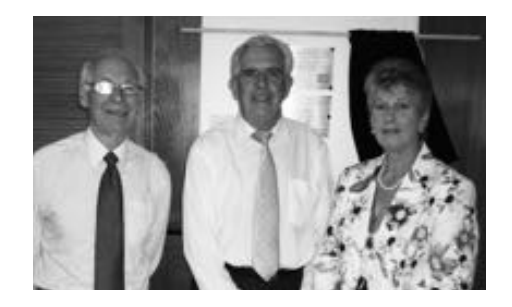
Garth & Trevor Community Centre

Due to the illness of the Mayor of Wrexham the immediate past Mayor deputised and officially opened the Garth & Trevor Community Centre on Saturday 30thof August 2008. Following the extensive refurbishment which has taken place, with the help of grants from WREN, the Welsh Assembly Community Facilities and Activities Programme, the Llangollen Rural Community Council, Aqueduct Association and Wrexham County Borough Council. Thanks to Davies Brothers being the main contractors and completing the work on time and on budget.